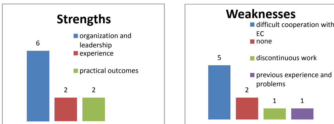
Graph n.2 – Strong and weak points of the network organization

On the other hand, five members found cooperation with the EC difficult, one also noted on discontinuity of his work. One member sees the previous experience and problems as the barriers of the work. Two of them did not see any inconvenience within the organization.